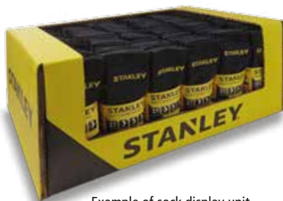
Example of sock display unit

Mens 3 pack workwear socks with reinforced heel and toe.